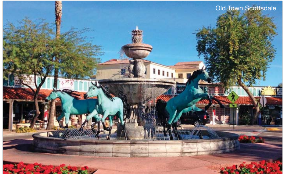
Old Town Scottsdale

elegantly tossed with garlic, olive oil, Calabrian chiles, and a scattering of mudicca (Italian breadcrumbs) to add texture and soak up all the goodness. Dessert? The Budino is Nutella pudding with vanilla crema and hazelnut praline: need I say more? Whatever else you do, be sure to stop in this brilliant new spot!