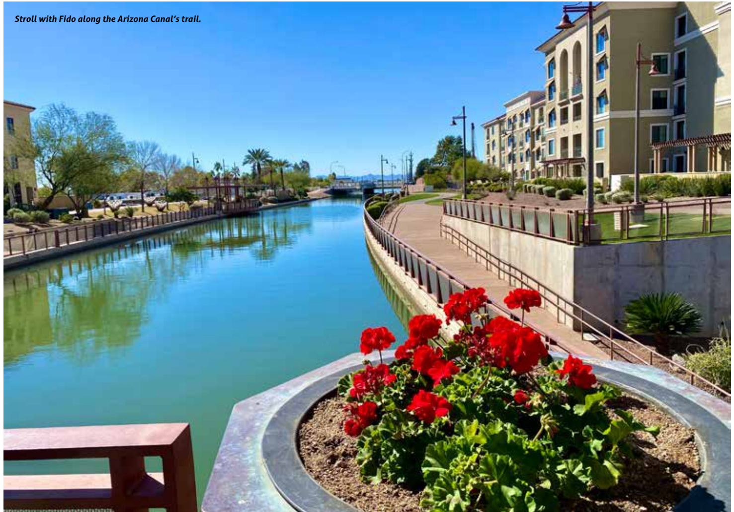
Stroll with Fido along the Arizona Canal's trail.